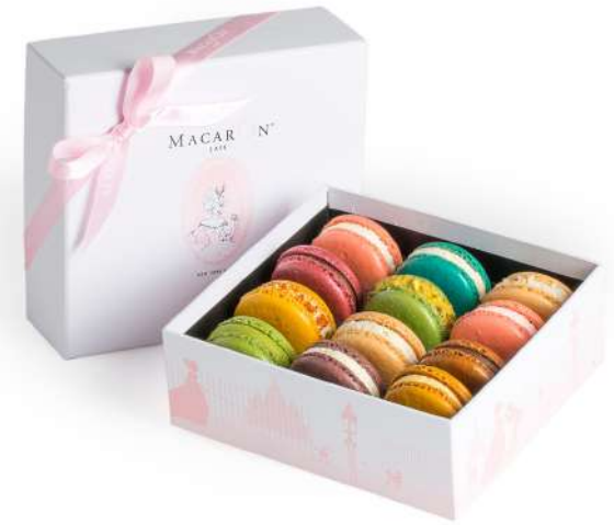
12 Macarons Medium Luxury Gift Box (shippable) $40.00