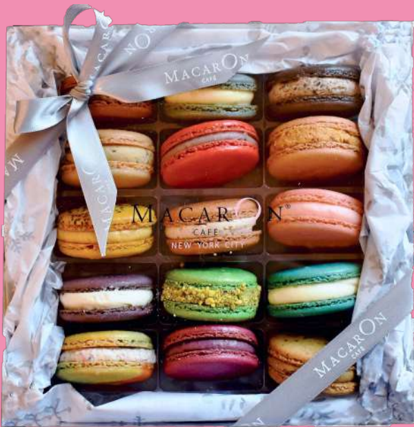
15 Macarons Winter Wonderland Gift Box $45.00

Also available with 24 macarons for $64.00