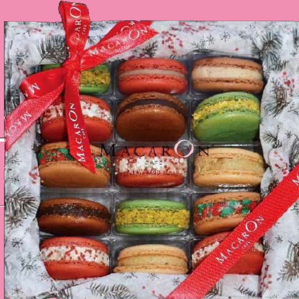
15 Macarons Holiday Gift Box $45.00

Also available with 24 macarons for $64.00