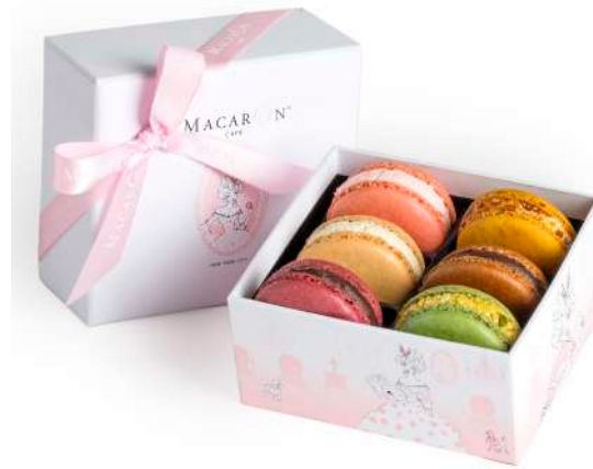
6 Macarons Small Luxury Box (shippable) $23.00

Dimensions of macarons: 2 inches in diameter and 1 inch high