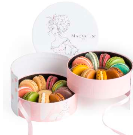
18 Macarons Queen Catherine de Medicis Box (shippable) $60.00