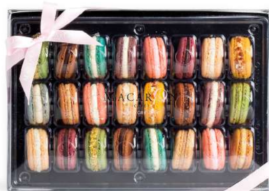
24 Macarons Large Classic Gift Box (Shippable)