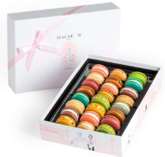
24 Macarons Large Luxury Gift Box (shippable) $73.00