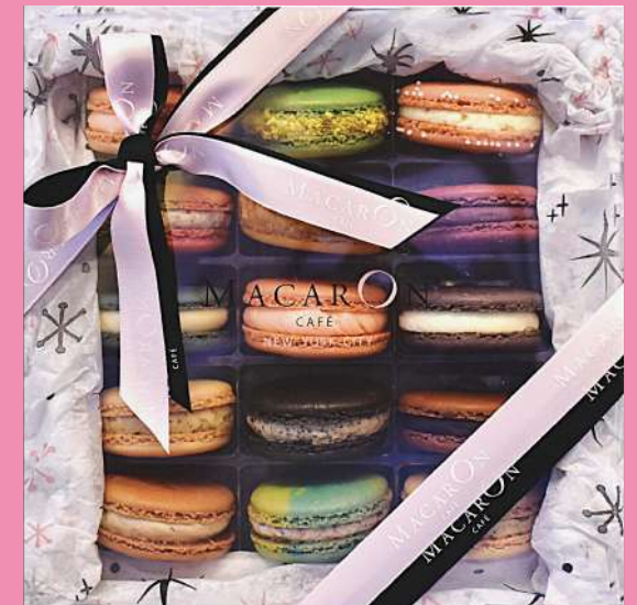
15 Macarons Celebration Gift Box $45.00

Also available with 24 macarons for $64.00