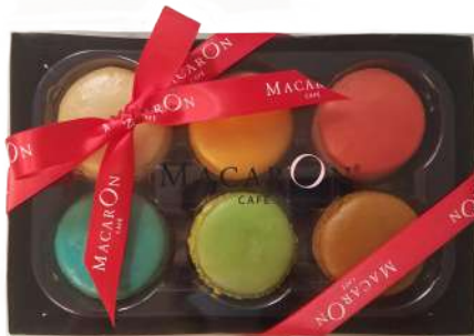
6 macarons Small Classic Gift Box (Shippable)